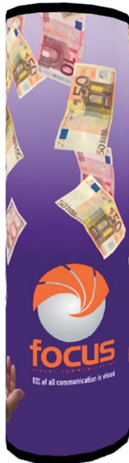
3x1 Tower 222.5cm high x 65cm wide