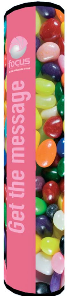
4x1 Tower 295.5cm high x 65cm wide